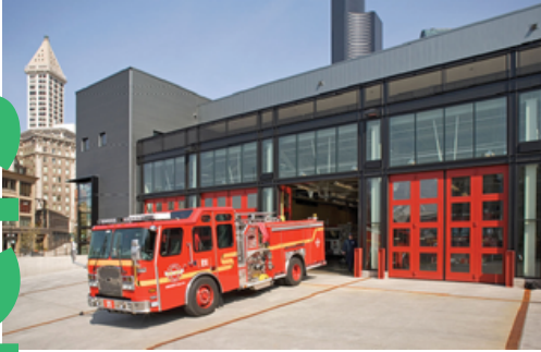
Fire Station 10/EOC/FAC