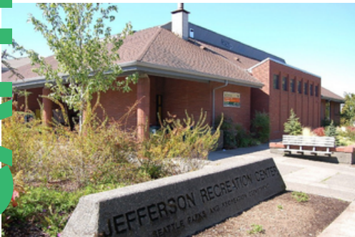
Jefferson Community Center

North Queen Anne Drive Bridge*** $1.2 million in grant funding