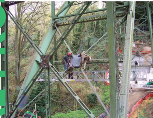
North Queen Anne Drive Bridge