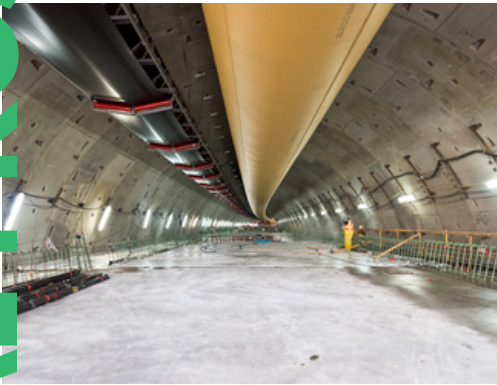
SR-99 Tunnel (Viaduct Replacement)