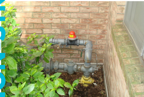
Central Area Senior Center