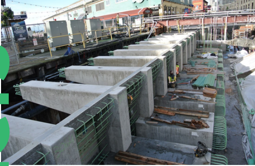
Elliot Bay Sea Wall